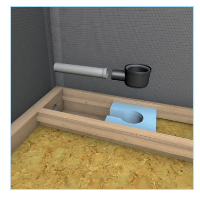
The wedi Fundo channel drain-substructure element provides secure and tailored support for the drain under the Fundo RioLigno.

The fully sealed slim shower element is developed especially for installation in suspended timber floors. Thanks to its thickness of just 25 mm at the outer edges, it can be integrated flush with existing floorboards without time-consuming levelling measures. The result is an accessible walk-in-shower with elegant linear drainage and peace of mind about the moisture-sensitive timber floor.