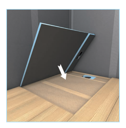
Thanks to the low height at its outer edges, flushto-floor installation with the Fundo RioLigno is simple and straightforward.